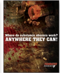
Drug- and Alcohol-Free Workplace Program

Yes! I would like to receive complimentary risk management materials from Federated Insurance.