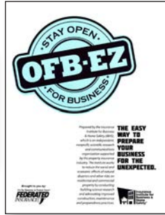
Disaster Planning Tool Kit