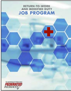
Return-to-Work and Modified Duty Program