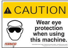
Eye Protection Sign